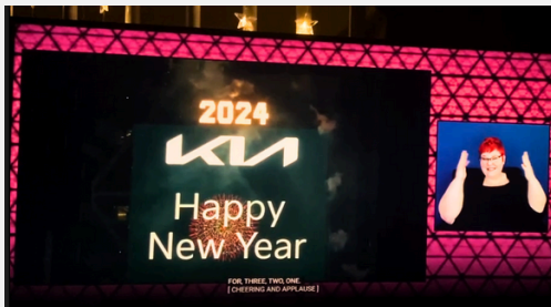
Online Livestream Services