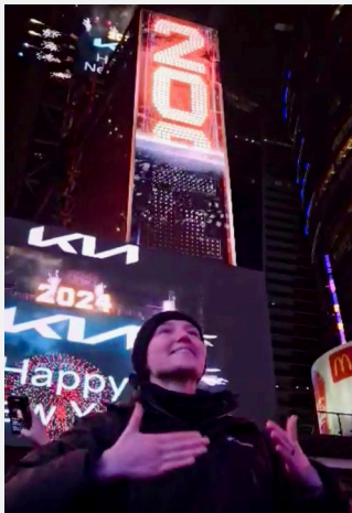
Live Services Onsite