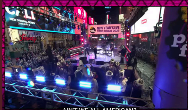
AIN'T WE ALL AMERICAN? (OH RIGHT, WOO)